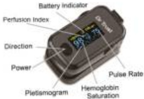
Figure 4.2 OLED Display

After switching on, the OLED display of the Dr Trust Pulse Oximeter is as follows: