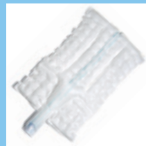
WARMTOUCH™ CARDIAC BLANKET STERILE

Precise, localized warming with adjustable tape positioning.