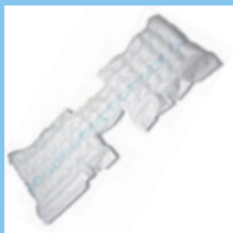
WARMTOUCH™ UPPER BODY BLANKET

Easy access to chest tubes, arteries and pulse checking. Also available for pediatric.