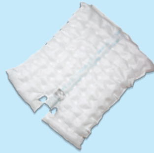
WarmTouch™ Lower Body Blanket