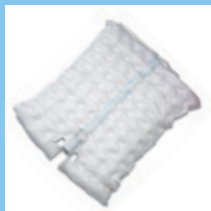
WARMTOUCH™ LOWER BODY BLANKET

Precise, localized warming with adjustable tape positioning.