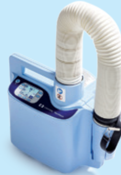
WarmTouch™ Convective Warming Unit