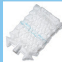
WARMTOUCH™ PEDIATRIC SURGICAL BLANKET

Unique design to minimize air distribution at patient's feet.