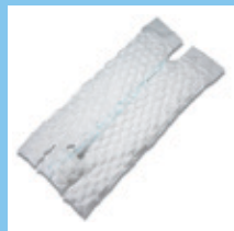
WARMTOUCH™ FULL BODY BLANKET

A full range of blankets to accommodate a range of patients and procedures.