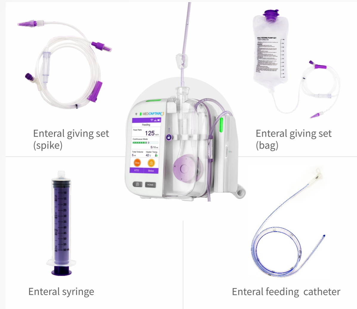
Enteral giving set (spike)